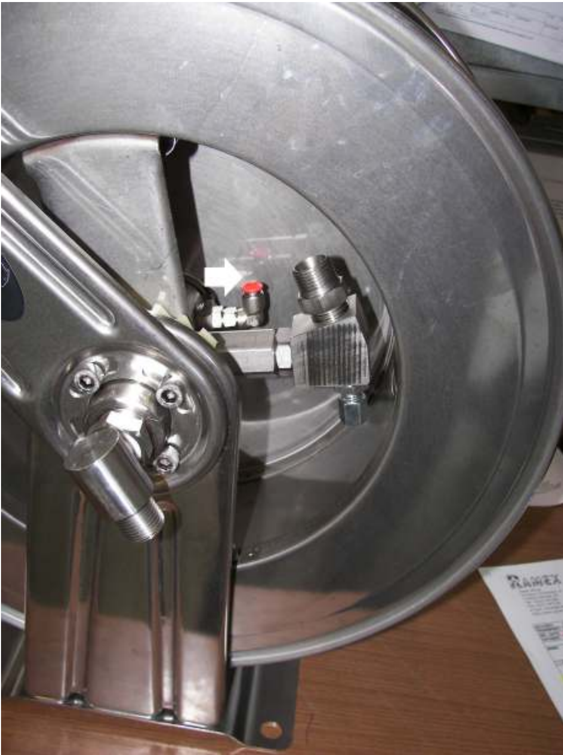
Connect the "Rilsan" hose on the quick connector